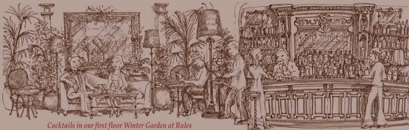
Cocktails in our first floor Winter Garden at Rules