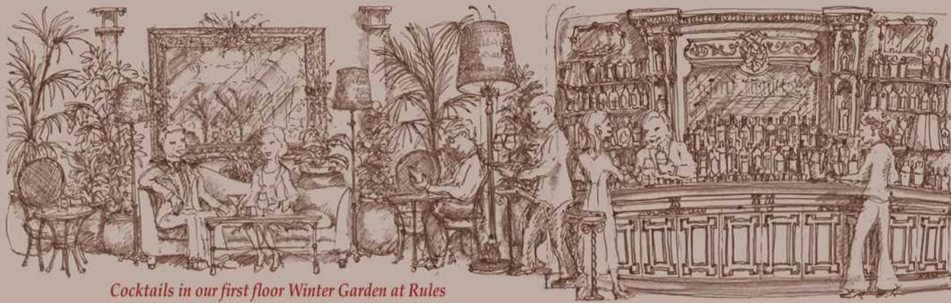
Cocktails in our first floor Winter Garden at Rules