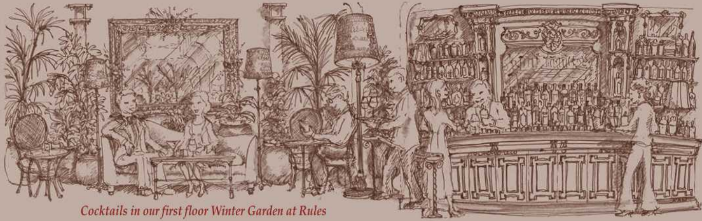
Cocktails in our first floor Winter Garden at Rules