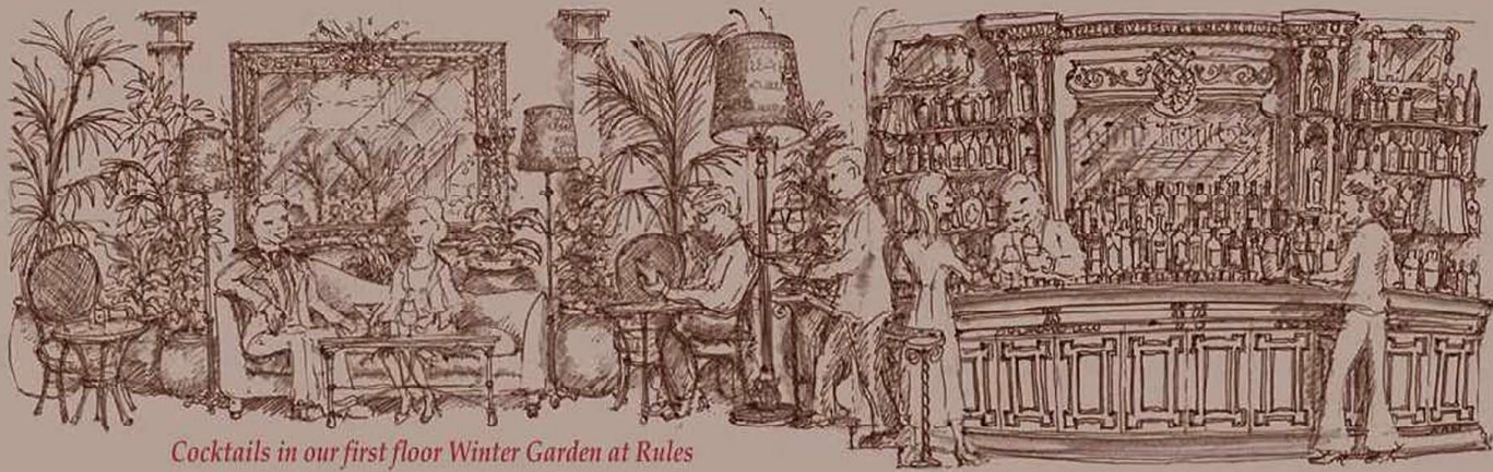
Cocktails in our first floor Winter Garden at Rules